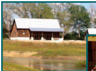
Retreat under construction

the results of the effort, love and prayer? First and foremost, 89% report they have a deepened relationship with God. In addition, Serenity Retreat has documented positive change in four major areas: