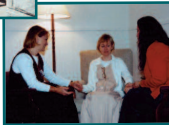
Early experiences with TPM

In May, 2000 the first Serenity Retreat was opened at the Garden Villas United Methodist Church. It was created out of a little paint, a little plaster and a great deal of faith. That was the extent of this burgeoning ministry. But from simple beginnings arise great institutions.